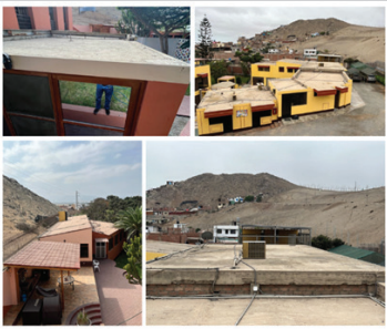
To better explain these projects, videos are available on line at www.homeajpm.org/campus-projects .

The building support column project was started last year, leaving work to be done in the warehouse, workshop and administration buildings. Grotto work to be done includes concrete, stone and railing repair and replacement. Kitchen plumbing includes replacement of plumbing under the floor in the kitchen area.