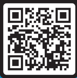
To learn more, go to homeajpm.org/sponsorship .

It is our hope that every child is matched with two sponsors in the first few months of their arrival. Please consider sponsoring one of our new children and help them feel the love and care that a sponsor provides.